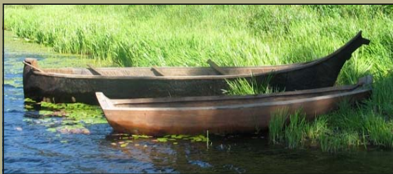
Confederated Tribes of the Coos, Lower Umpqua, and the Siuslaw